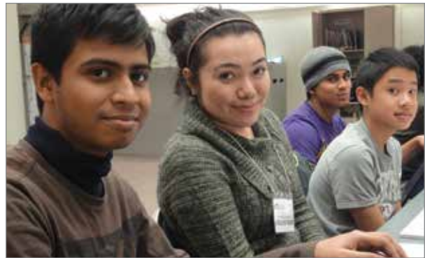
Young volunteers help newcomers at the Library's After School Newcomer Hubs.