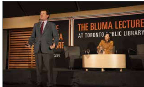
Nicholas Kristof and Sheryl WuDunn at the inaugural Bluma Lecture.