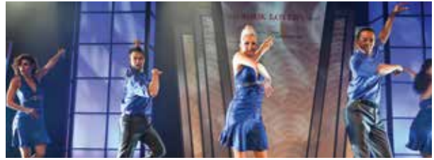
Entertainment at The Book Lover's Ball.

The Book Lover's Ball raised $530,000 in support of Toronto's Library in 2013. Presented by Sun Life Financial, the black-tie evening of literary discovery included dazzling novel-inspired entertainment and brought more than 500 book lovers together with more than 50 of Canada's top literary celebrities. The evening was hosted by Cityline's Tracy Moore and Melanie Ng. Notable guests included