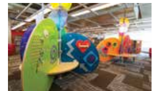
KidsStop at Fairview Branch

of play in a preschool child. Children and caregivers play and learn together in an environment that supports reading readiness.