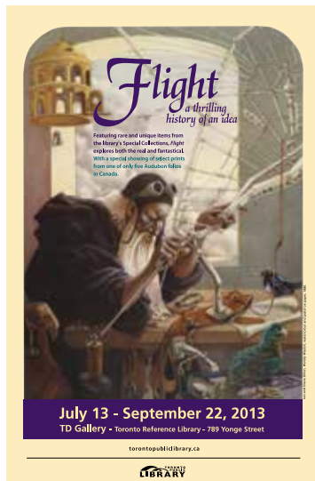
Flight: A Thrilling History of an Idea was one of several exhibits hosted at TD Gallery.

On the main floor of the Toronto Reference Library, the TD Gallery frequently hosts exhibitions from the Library's Special Collections, which document Canada's cultural history, including the early exploration of the North. Thanks to TD's steadfast support, the Library redesigned and expanded the gallery as part of the re:vitalize campaign. Its 2013 shows included Royal Fanfare , exhibiting engravings, photographs, souvenirs and games from royal celebrations from the 16th to the 20th century; Adventures with Sherlock Holmes , including rare books, manuscripts and fascinating details about the great detective; War Stories , which featured first-hand accounts of the War of 1812-1814; and Flight: A Thrilling History of an Idea , which explored the history of aviation through storybooks, paintings, model inventions and machines.