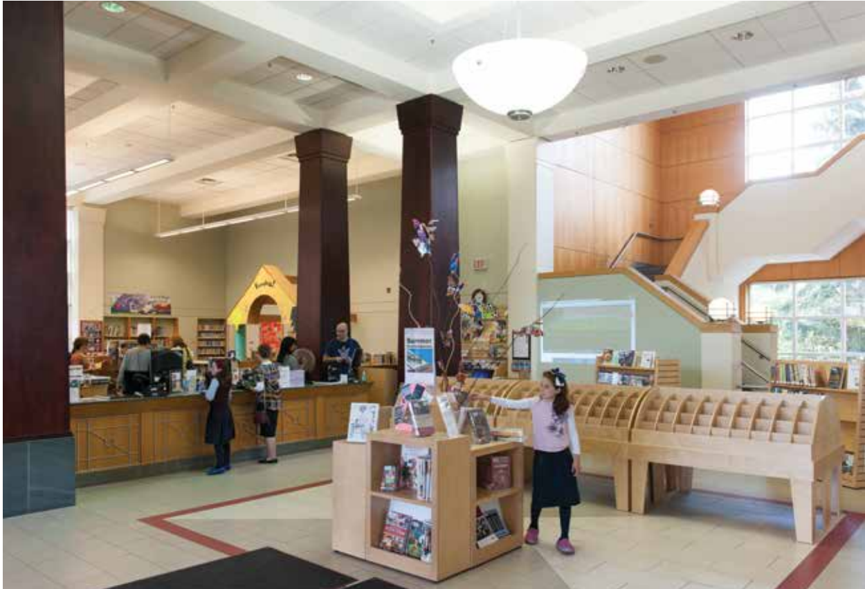
The Barbara Frum branch.