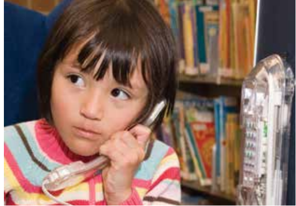
Dial-a-Story is available in branches and from any telephone.

Thanks to a wonderful $4,000 gift from the Josephine Henderson Foundation, Toronto Public Library's Dial-a-Story program expanded into a 16th language (Persian, with 19 stories available) and added 12 new English, 11 new Spanish and six new Portuguese stories for a total of 654. Dial-a-Story is a free, multilingual telephone story program. Children of all ages can experience the wonder of stories just by dialing 416-395-5400.