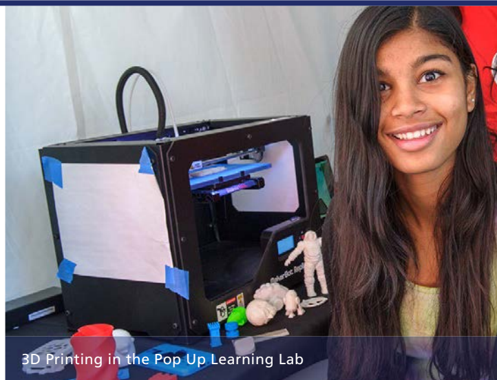
3D Printing in the Pop Up Learning Lab