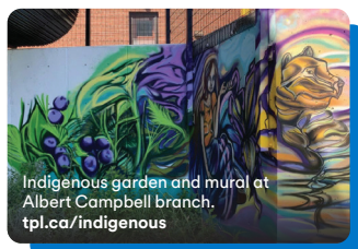
Indigenous garden and mural at Albert Campbell branch. tpl.ca/indigenous