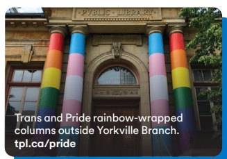
Trans and Pride rainbow-wrapped columns outside Yorkville Branch. tpl.ca/pride